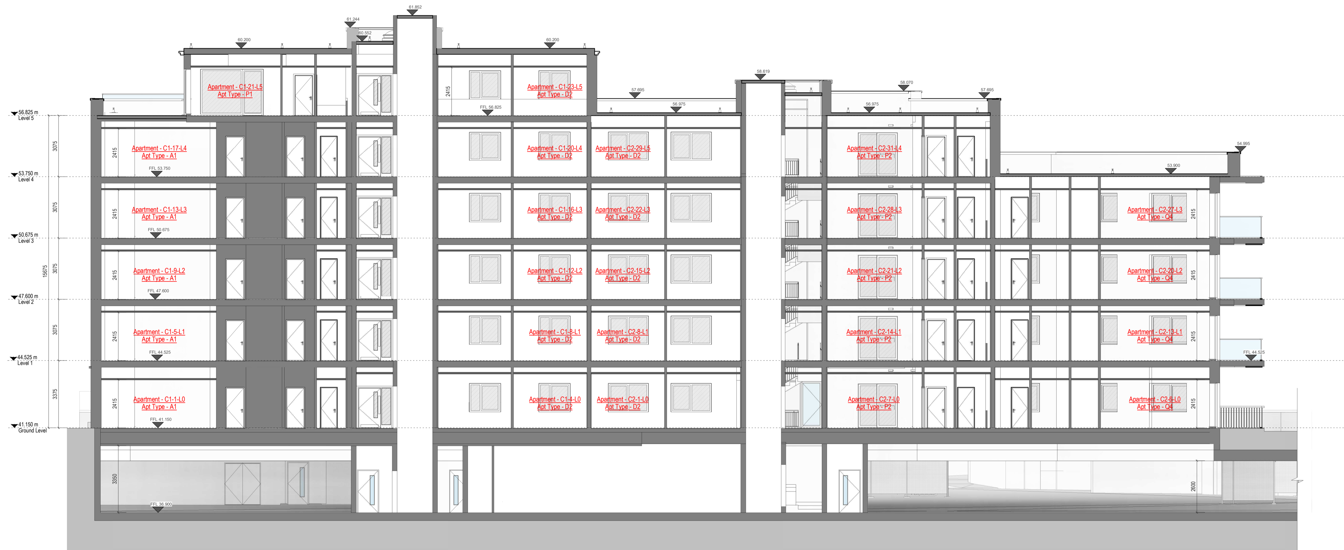
1 GA - Section BB 1 : 100